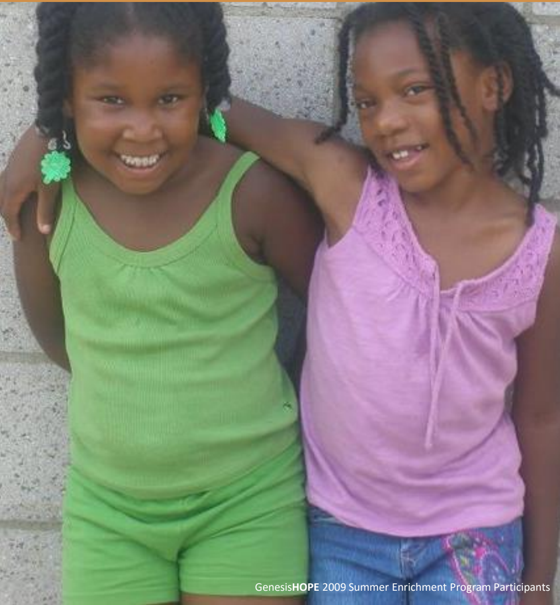
GenesisHOPE 2009 Summer Enrichment Program Participants

Genesis Harbor of Opportunities Promoting Excellence (GenesisHOPE) Community Development Corporation , a 501(c)(3) tax exempt MI charitable corporation founded in 2009. The emerging community development corporation is dedicated to building community.