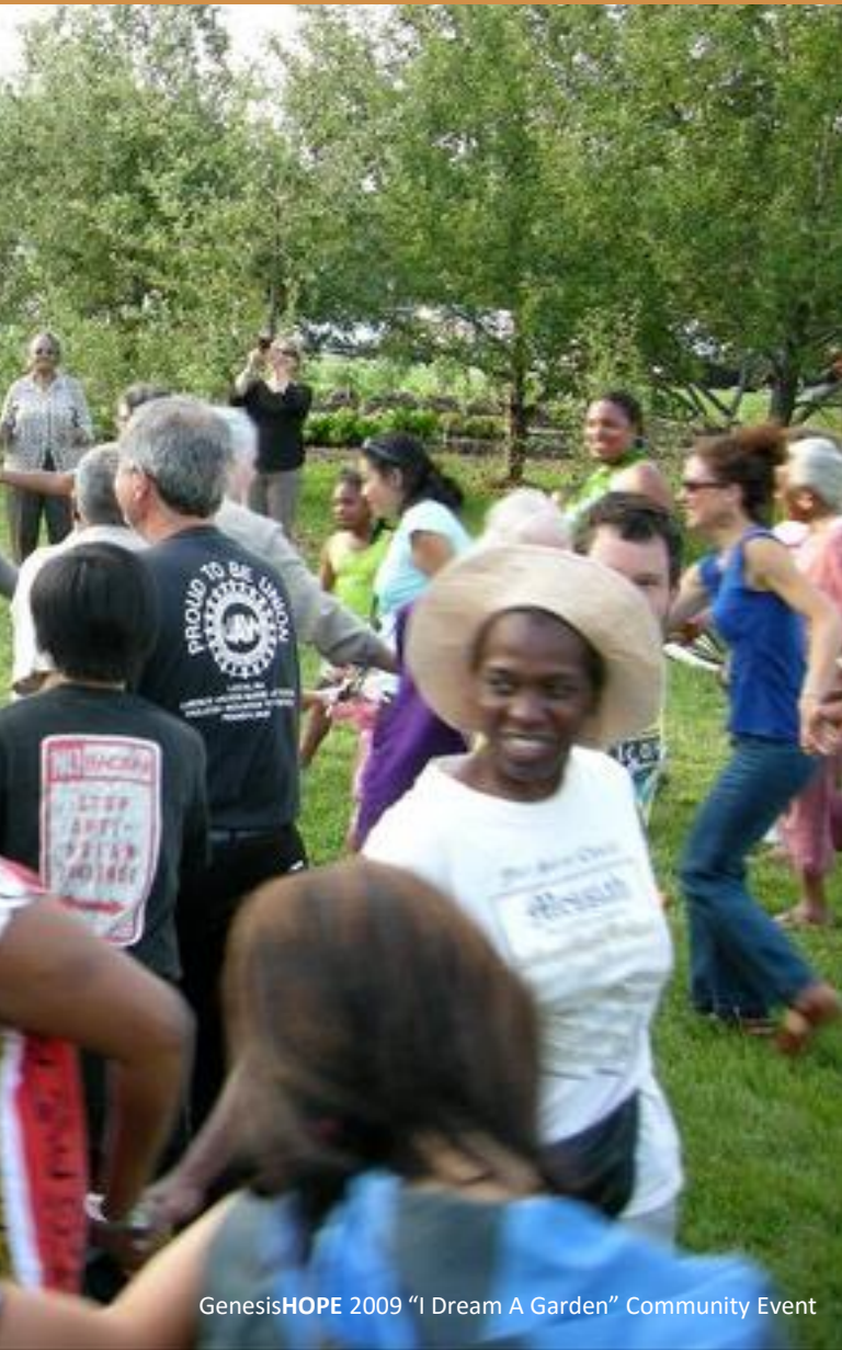
GenesisHOPE 2009 “I Dream A Garden” Community Event

Over the last three years in advancing the mission, GenesisHOPE has: